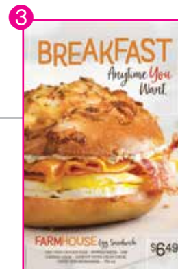
3 Drive Thru (if applicable): Farmhouse Sandwich