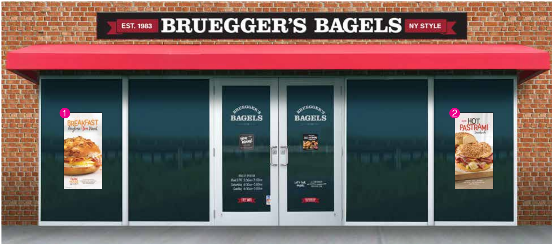
1 Window Poster: Farmhouse Sandwich